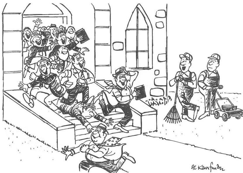
'The Reverend must have given 'em quite a pep talk today'